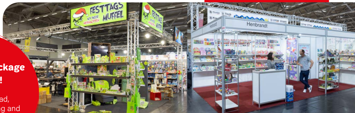
The images show examples only. For detailed information, please contact us.

Double-page ad, banner advertising and much more!